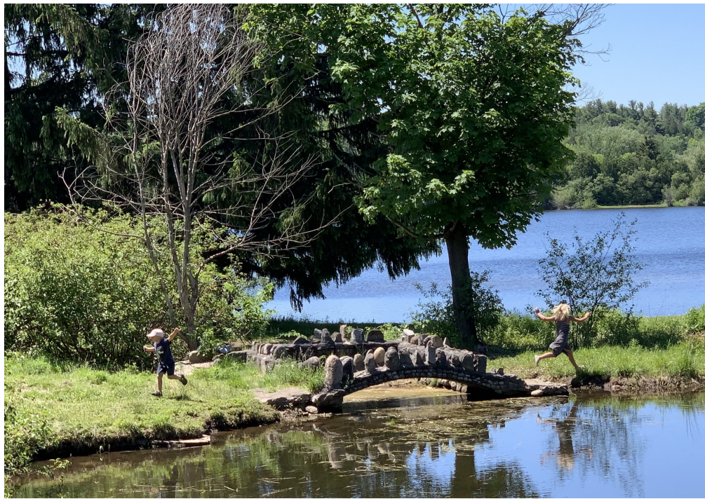
Little stone arc bridge between the ponds – a lovely place to run!