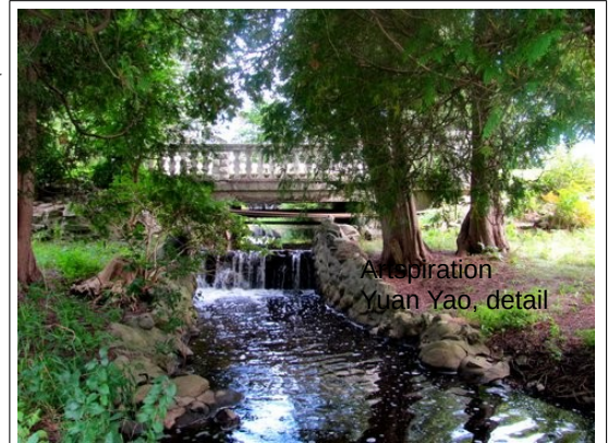
Artspiration Yuan Yao, detail

In its Reformatory days, the Yorklands was a place where young men were trained in a variety of trades. One was stonework and masonry. The inmates quarried stone on site, and built most of the buildings including the Administration building. They also landscaped the site with fieldstone walls, and cut stone stairways, walls and bridges. Walking the Yorklands today, you can enjoy this heritage landscaping that makes the site a unique piece of our urban heritage, which we are working to preserve for Guelph's future.