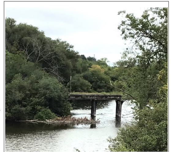
Wooden railroad trestle over the Eramosa River