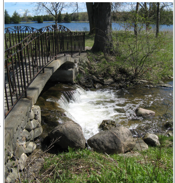
Former footbridge over Clythe Creek