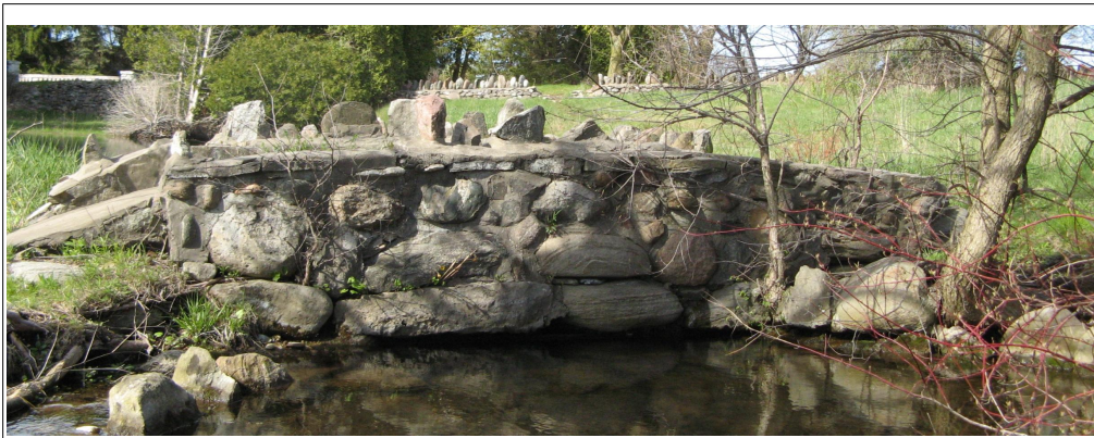
Small stone bridge across Clythe Creek and stone border walls