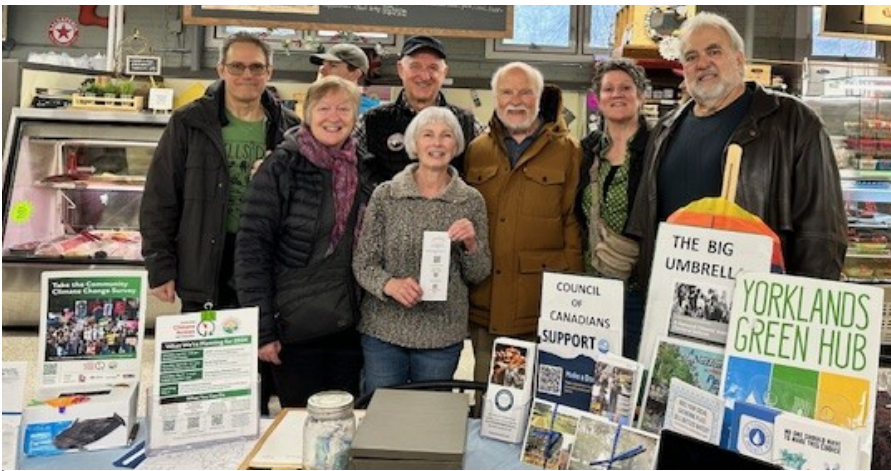
Launch of Community Climate Survey at the Guelph Farmers' Market