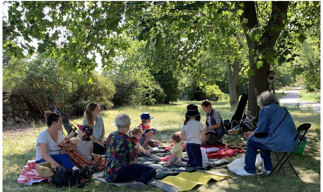
Noticing Nature families drawing their discoveries in the shade.