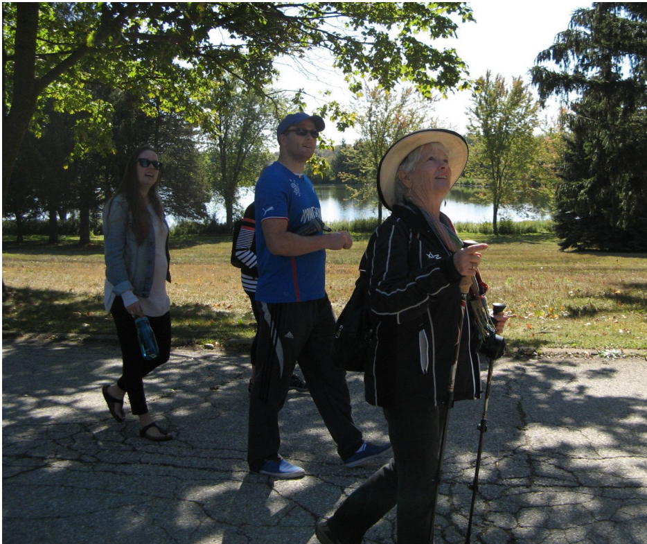
It's an interesting, relaxing place to walk at Guelph's historic Yorklands.