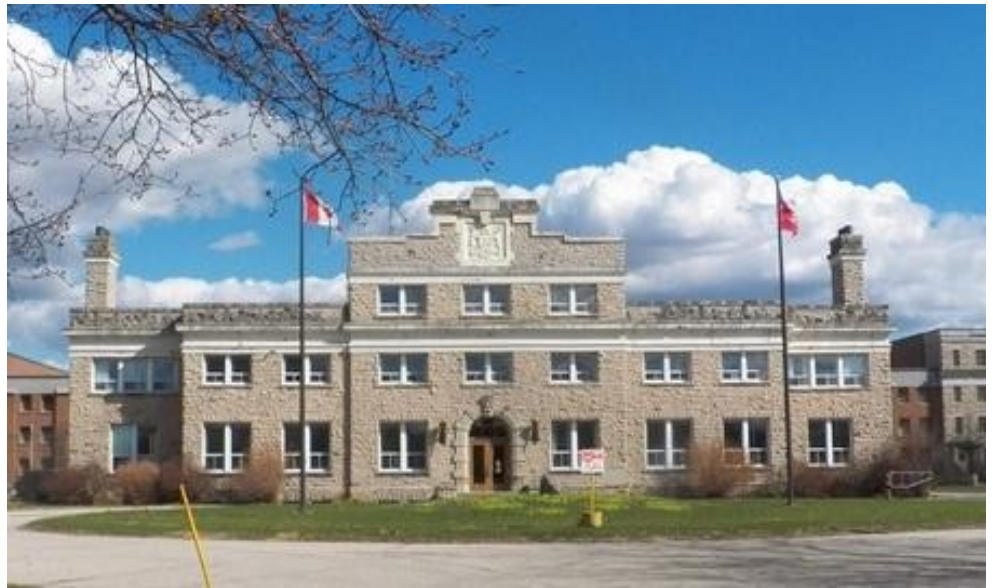
The Administration Building at the former Ontario Reformatory/Guelph Correction Centre, Guelph, ON

To register, please email info@yorklandsgreenhub.ca with the subject "Noticing Nature 2023." ☆