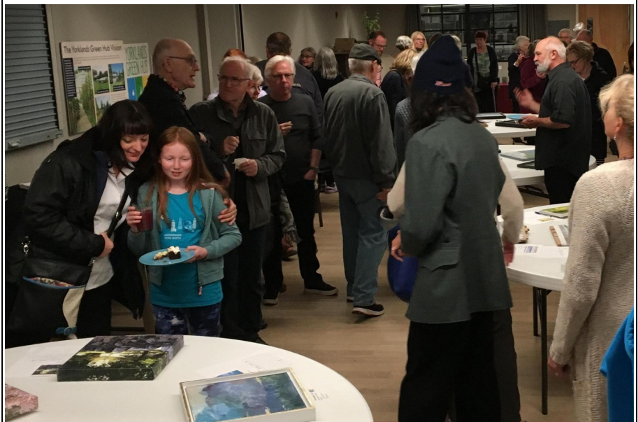
Artspiration guests enjoy the art and make their final bids.