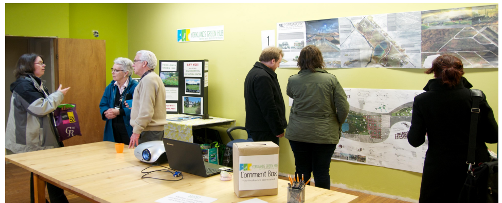
YGH welcomed visitors to consider, discuss and vote on site design features.

Specific objectives for this portion of the design project were to meet the goals of the YGH vision for our proposed provincial sustainable environment centre: food production and security, water and wetland protection and restoration, renewable energy demonstrations and job creation.