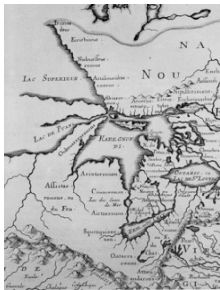
An early French map of the Great Lakes - the Chonnonton or Neutral lived north and west of Lake Ontario, and north of Lake Erie.

The most influential leader of the Chonnonton was Tsouharissen, a chief whose council united some ten First Nations groups to form, at a time when confederacies were the common form of tribal alliances, a powerful chiefdom. Tsouharissen, “Child of the Sun,” ruled as both priest and chief over his domain from the settlement of Ounontisaston (SE of present day Brantford). His influence was noted by French missionaries who were received by him at the peak of his powers.