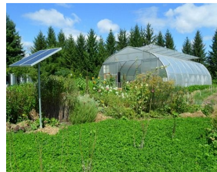
Solar demonstrations will be a key feature in the Yorklands Green Hub project.