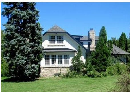
The Superintendent's house

We have important news to share with our supporters and members!