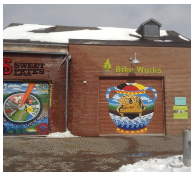
Historic site, new uses

Celeste discussed the target amounts of money we should be focusing on, and recommended some tools to help track our fundraising.