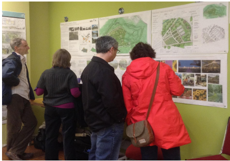
Visitors view UofG student designs.

On March 20 th , Yorklands Green Hub held a public Design Showcase Event at eMERGE Guelph in the Old Quebec Street Mall.