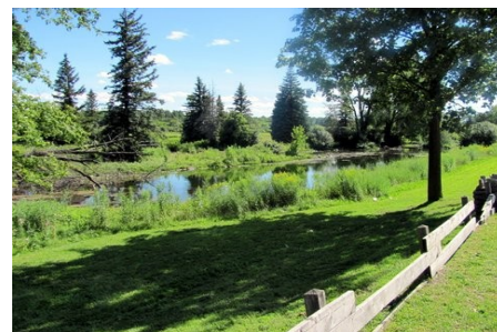
Clythe Creek runs through the proposed 47-acre heritage site.

The "adaptive reuse" and "significant natural area" designations on our chosen site are important for us.