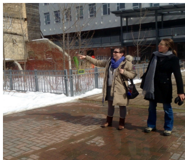
LEED building and inner courtyard.