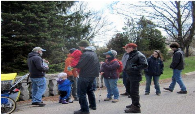
Participants in Jane's Walk at Yorklands Green Hub

On May 3rd and 4th, almost one hundred people came out to enjoy Jane's Walks led by YGH board members. Named in honour of celebrated urban visionary, Jane Jacobs, Jane's Walks have spread to many Canadian cities. The walks allow community members to share personally-researched aspects of local history, geography and urban culture with their fellow citizens.